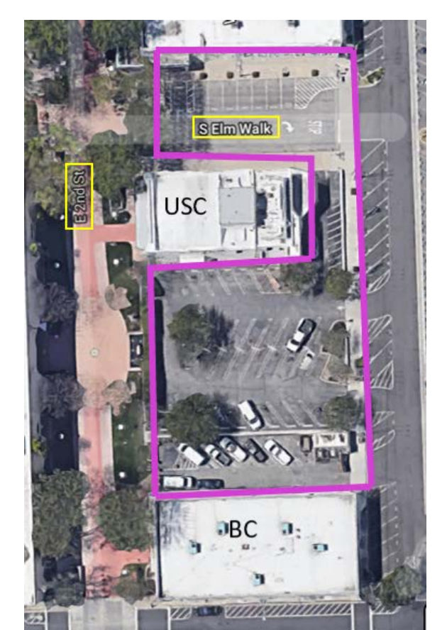
GUEST PARKING – LOT 17