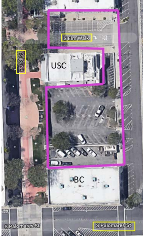
GUEST PARKING – LOT 17